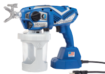
TC Pro Corded