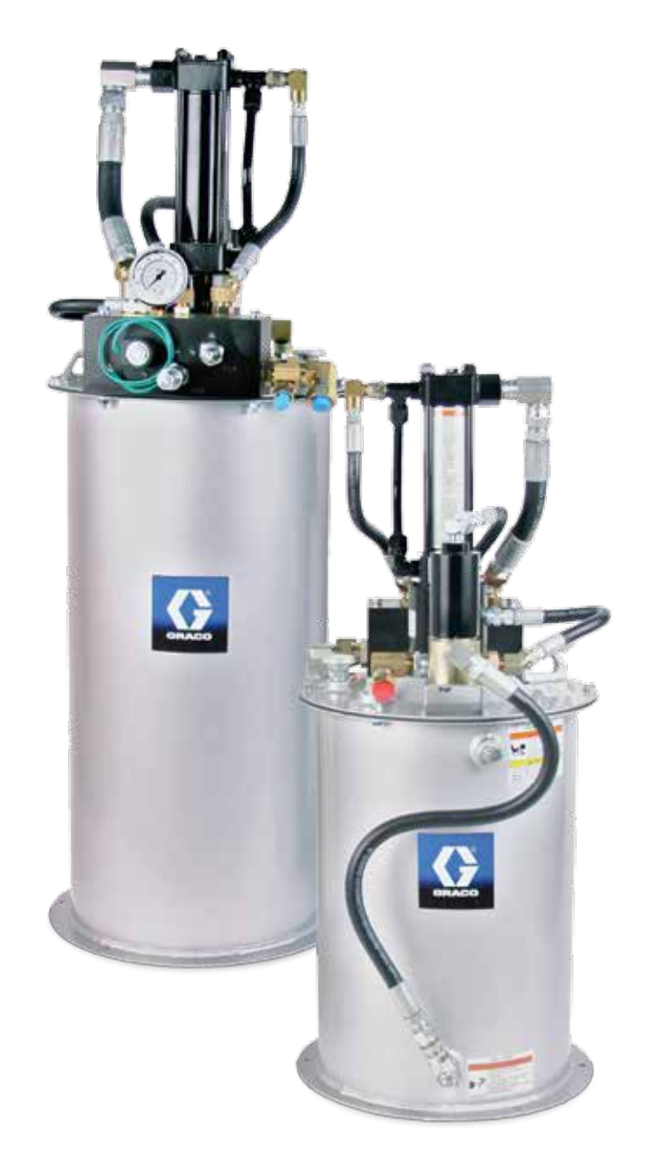
5:1 and 10:1, hydraulically-powered lubrication pumps designed for long life and reliable operation in demanding off-road mobile applications